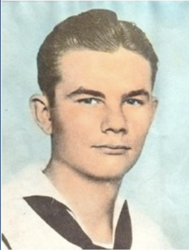
ST. THOMAS, VIRGIN ISLANDS 1942