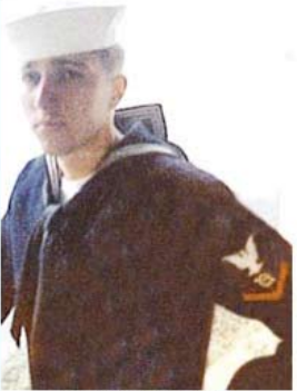
HONG KONG, CHINA 1960